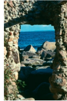
A view of the sea through the stone book Arx