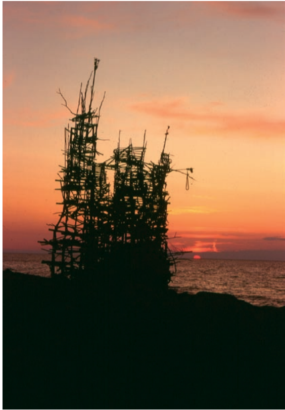
Wotan's Tower in Wotan City, the capital of Ladonia