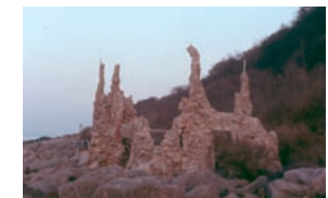
The stone book Arx in the summer