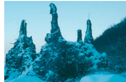
The stone book Arx in the winter