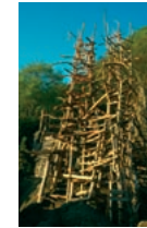
Nimis, part of Wotan City, the capital of Ladonia