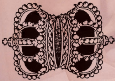
Royal Fertilization, 1996