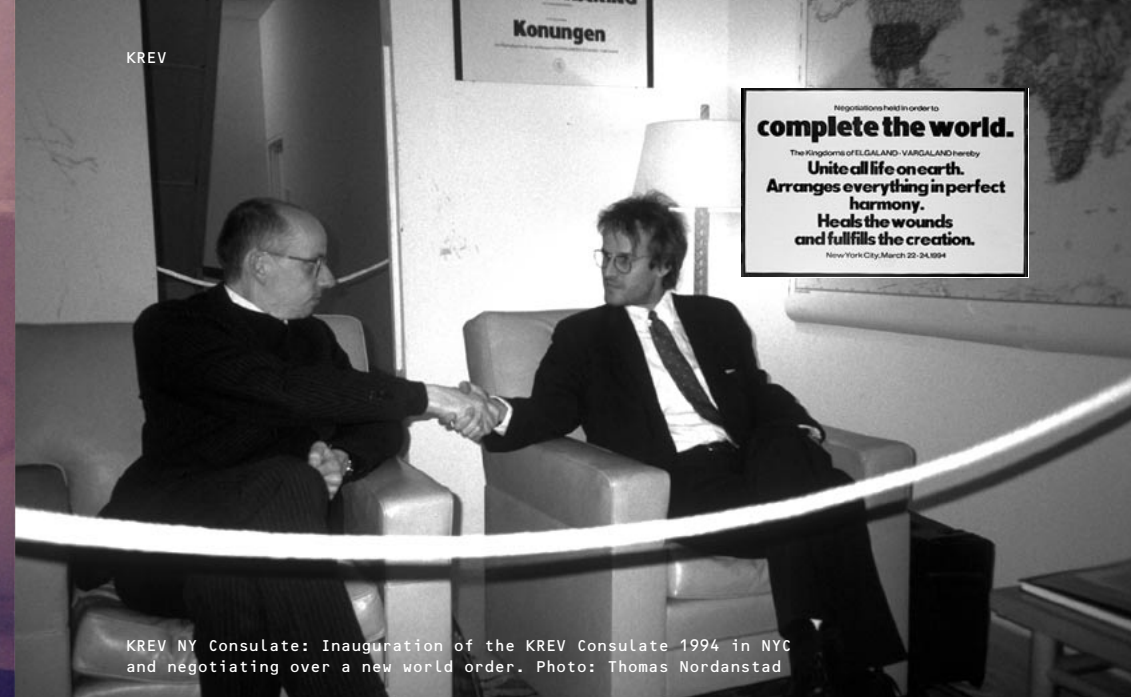
KREV NY Consulate: Inauguration of the KREV Consulate 1994 in NYC and negotiating over a new world order.