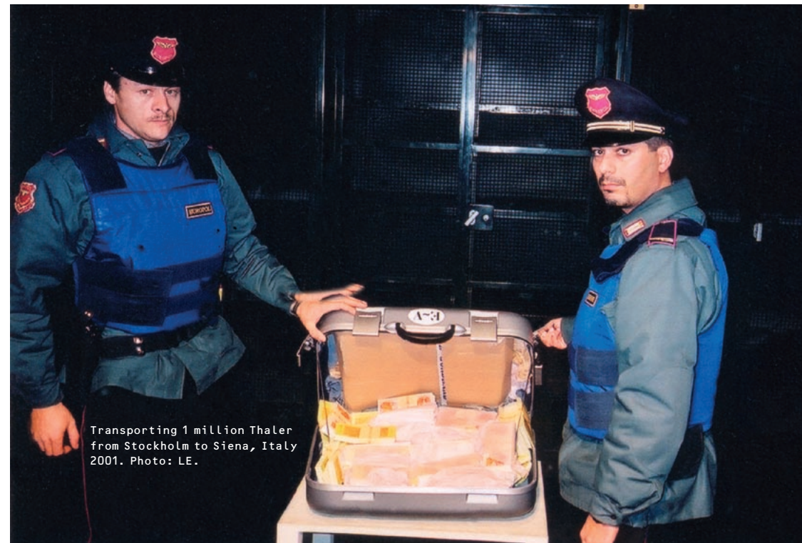
Transporting 1 million Thaler from Stockholm to Siena, Italy 2001.

§35 The national drink of the state of Elgaland/Vargaland is Kronvodka and Coca Cola.